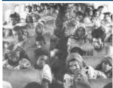
Jews fleeing Yemen, 1949

Published: 02/22/10, 9:51 AM / Last Update: 02/22/10, 10:16 AM