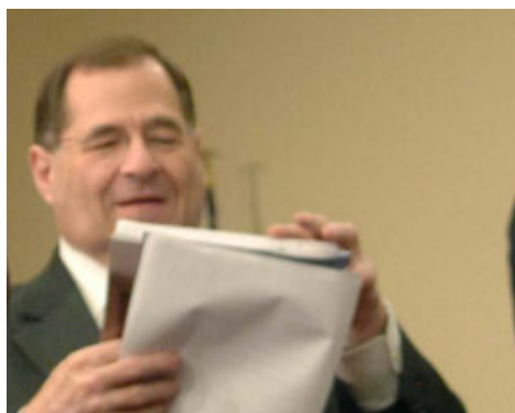
New York Democrat Rep. Jerrold Nadler. (Archives)