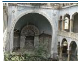
Abandoned Lebanese synagogue thejewsoflebanon.org